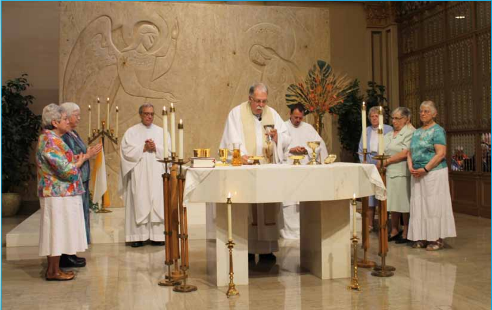
Mass in Annunciation Chapel is at the heart of many SCL community celebrations and gatherings.