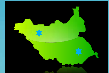
South Sudan, Africa