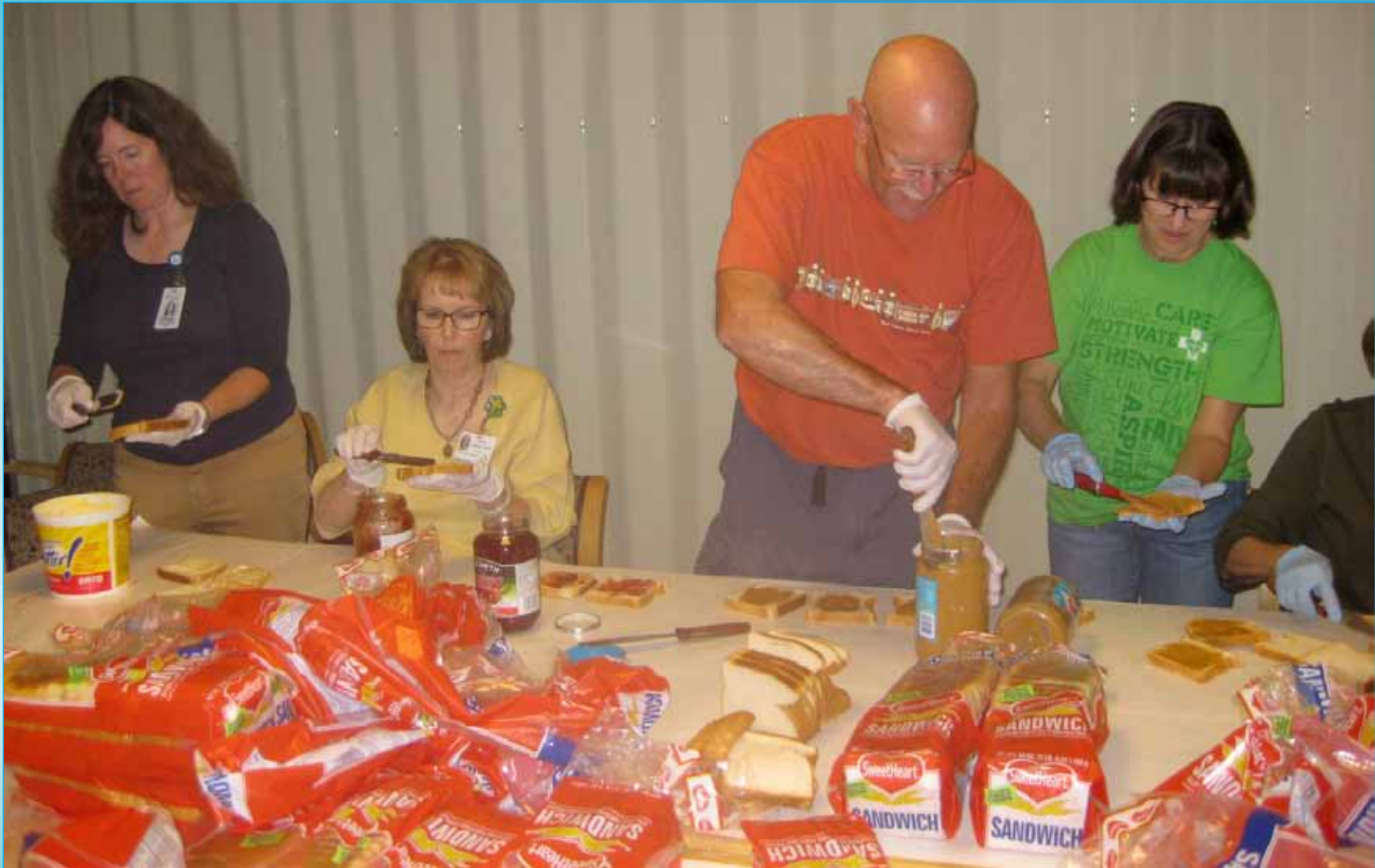
SCL Associates in Billings, Montana, prepare sandwiches to serve persons who are homeless.