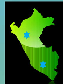
Peru, South America