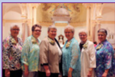
2014 Golden Jubilarians

National Religious Vocation Conference Convocation Chicago, Illinois