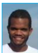
International Volunteer VMY Responsible for English speaking countries

...and Mary gave birth to her first-born son. She wrapped him in swaddling clothes and laid him in a manger, because there was no room for them in the inn (Luke 2:7).