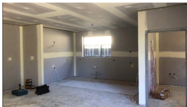
Dover Street property