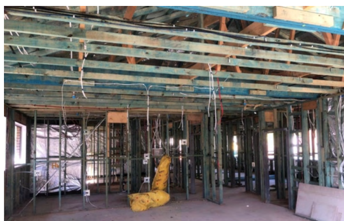
Koorong Street property