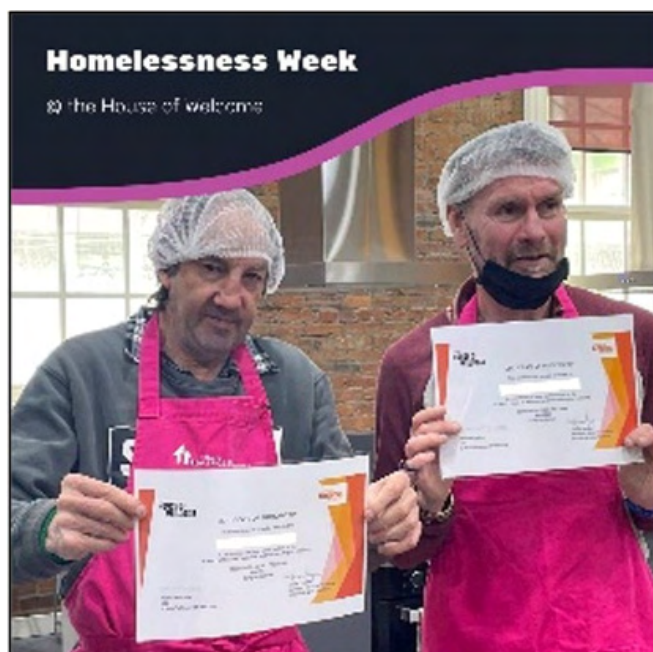
Two of our wonderful service users receiving their cooking certificate. They have just re-enrolled for the next course!

We are very excited to have started a new program in our Training kitchen with William Angliss Institute to take our service users through a 10-week certificate program in food safety, meal preparation and take their home cooked items with them to enjoy later, including chicken parmigiana, vegetarian lasagne and blueberry pies. The kitchen was built with the generosity of the Daughters of Charity gift funds.