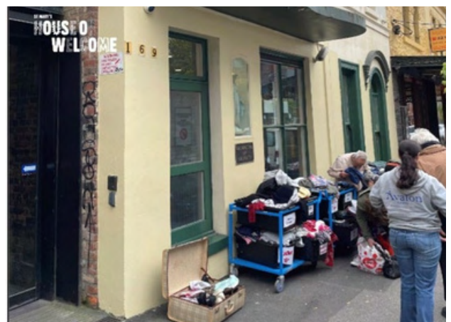
Avalon clothing shares new clothes at a market each month.