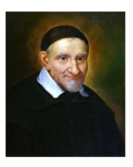
'We are priests of the poor. God has chosen them for us.' \,