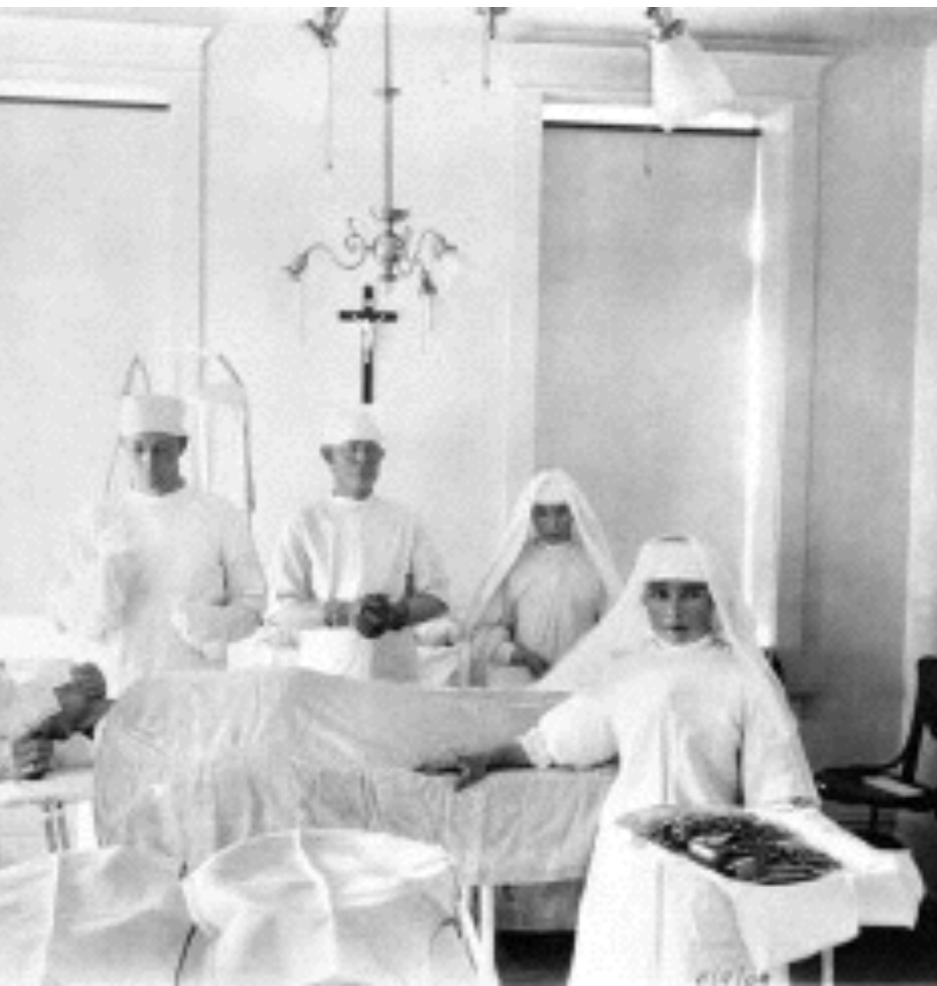
Sisters of Charity of Leavenworth assist Doctors with a surgery at St. Joseph's Hospital in Lewistown. 1909.