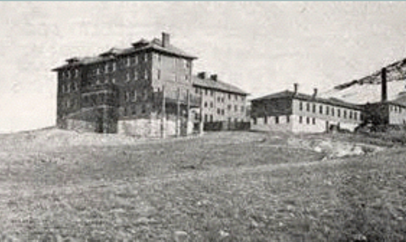
House of the Good Shepherd