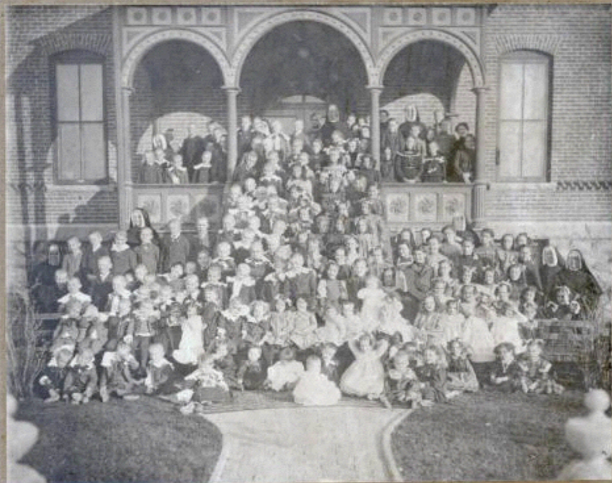
St. Joseph's Orphan Home, Helena, Montana.