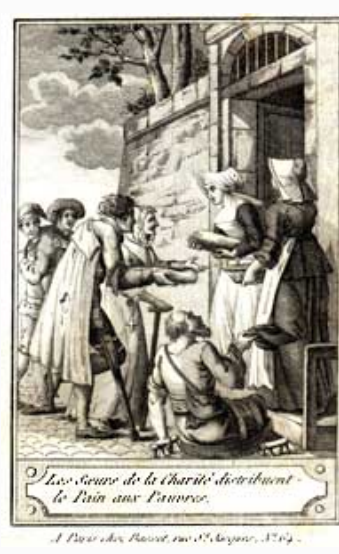
Welcoming the poor