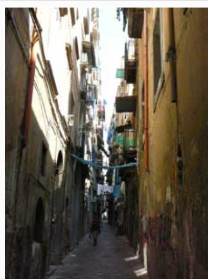
An alley of ancient Naples