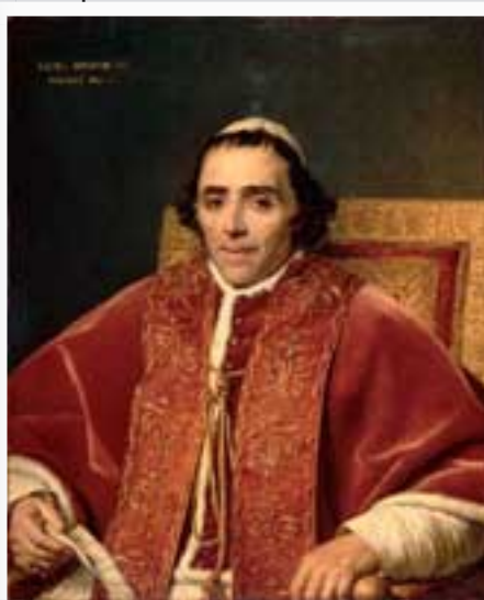
Pope Pius VII