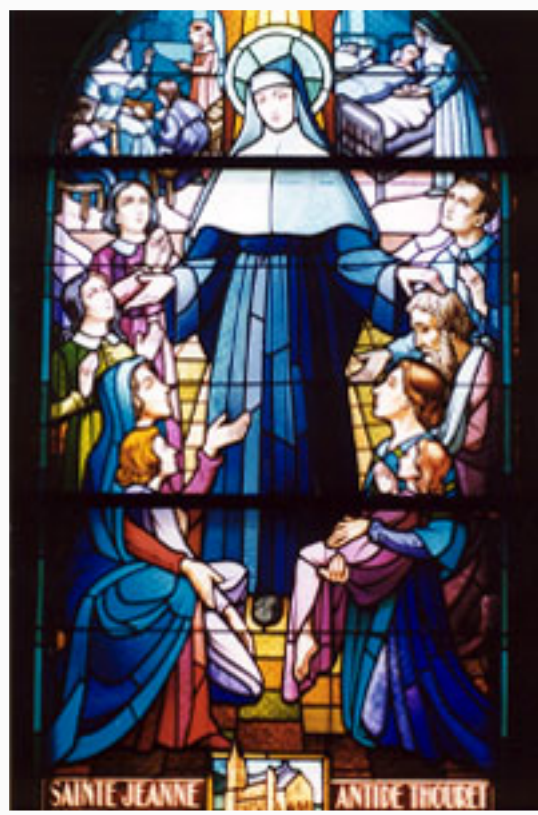
Stained glass of the church of Malbuisson (France)

Woman of transition, to whom everything seemed to succeed, Jeanne Antide won great struggles through her sufferings and the grace received, through her love for God and for the poor, love for the Church and her Congregation. The Church proclaimed her holiness the 14 th January 1934.