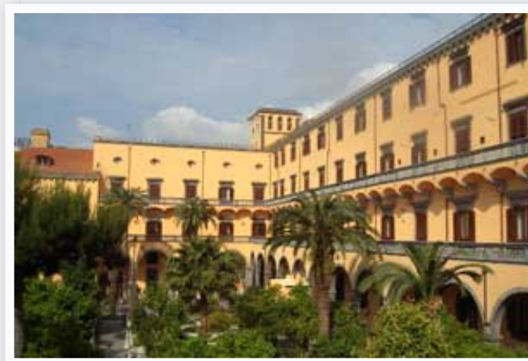
The monastery of Regina Coeli: the sisters' house.