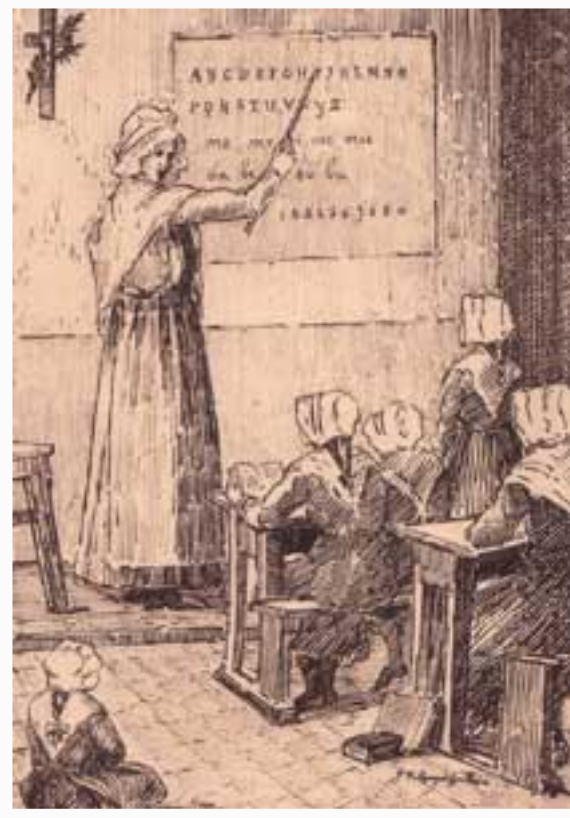
Jeanne-Antide in Sancey during the Revolution