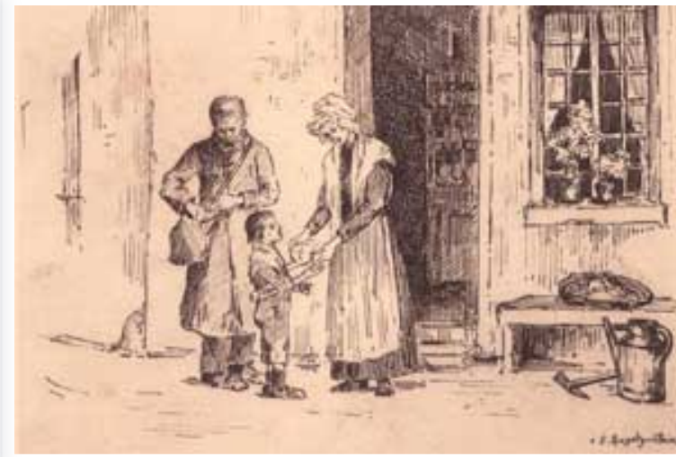
The house from where Jeanne-Antide left for Paris