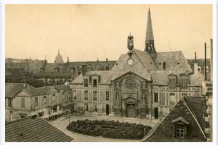
The hospital Laënnec: service place of Jeanne-Antide in Paris