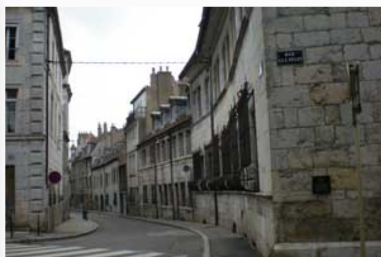
The rue des Martelots, place of the first community