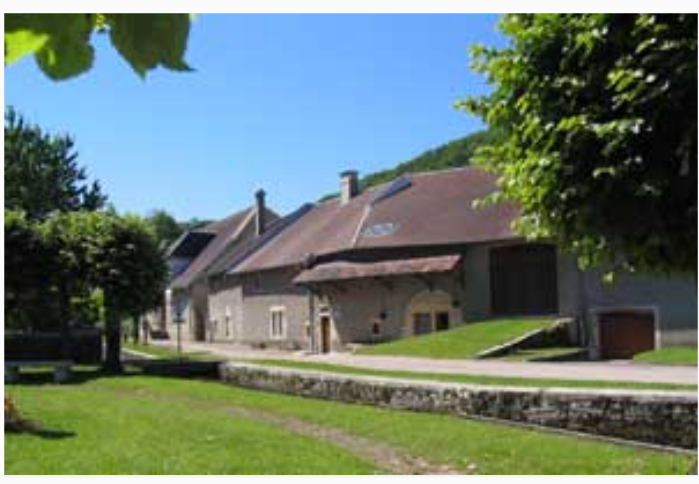
A service carried out by the Daughters of Charity