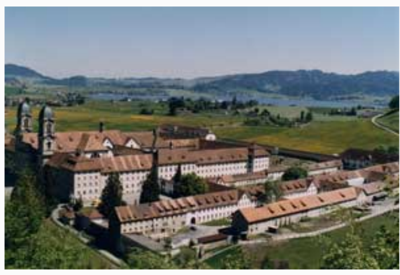
The abbey of Einsiedeln