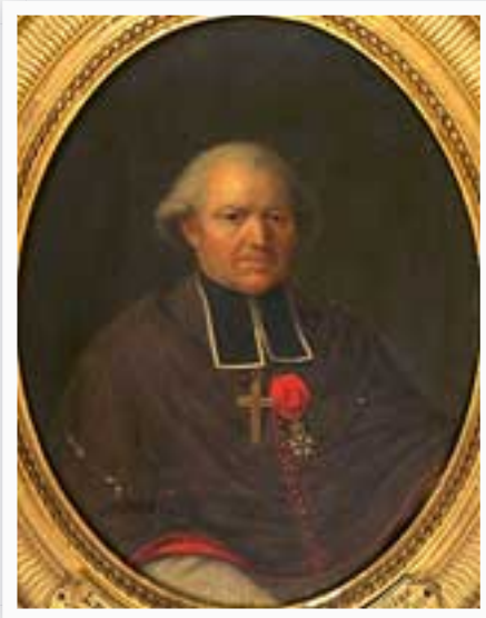
Mgr Lecoz, Archbishop of Besançon