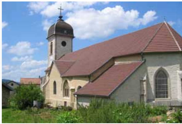
The church of Sancey