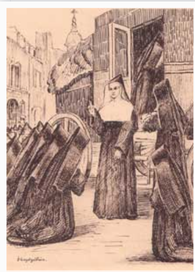
Jeanne-Antide, on leaving to Naples

Jeanne Antide accepts the Neapolitan adventure suggested by Madam Letitia, mother of Napoleon, with trust; she and her sisters prepare themselves as best as possible. A European citizen, in Naples, Jeanne Antide sows goodness, care, education, wonder for this new way of living among the world. But she is always at the mercy of adversities, poverty, jealousy ... and her restlessness about the communities left in France, where a wind of division is blowing, grows. The beautiful trunk of the tree rooted in Besançon does not recognize her anymore. She is tried by the division, at the same time, in 1819, the Church recognizes and approves her Rule of Life, one of the first presenting an apostolic feminine religious life.