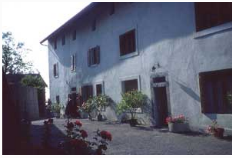
Saint Paul en Chablais: la maison du premier noviciat en Savoie

Passing through Savoy, at Saint-Paul en Chablais, Jeanne Antide re-takes the way to Naples. At each moment her prayer, nourished by a suffering lived with the Lord on the cross, overcomes the horizon of space and time and allows her to keep loving till death the rebel communities and to maintain the hope in spite of the definitive separation.