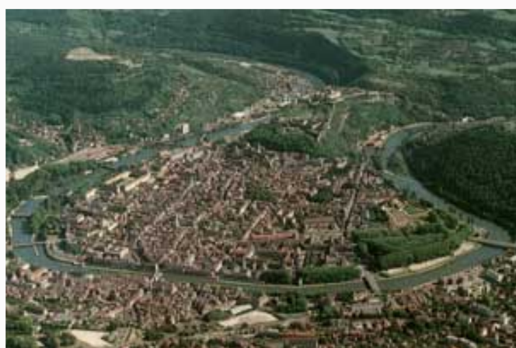
The city of Besançon

Finally she is in Besançon, with no other certainty than the mission entrusted to her and her abandonment to Providence! When she opens the first school the 11 th April 1799, the calm has not yet been re-established, Foundress under obedience of a Congregation that claims to belong to Saint Vincent de Paul from whom she draws the first elements of her Rule of Life. In ten years time, Jeanne Antide works, struggles, forms young sisters, takes care of the sick, establishes services, cooperates with the local authorities in taking charge of the poor and supports the Church. Recognized at a civil level by the Prefects, then by Napoleon himself, her foundation acquires a fame that expands to the neighbour Countries, in Savoy, in Switzerland, and in Naples, the great city rich of its poverties, of its history, still wounded by the passage of the French army.