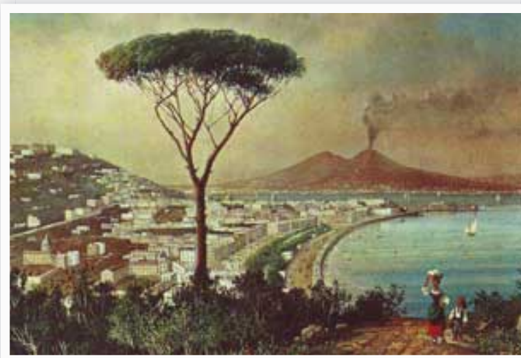
The city of Naples