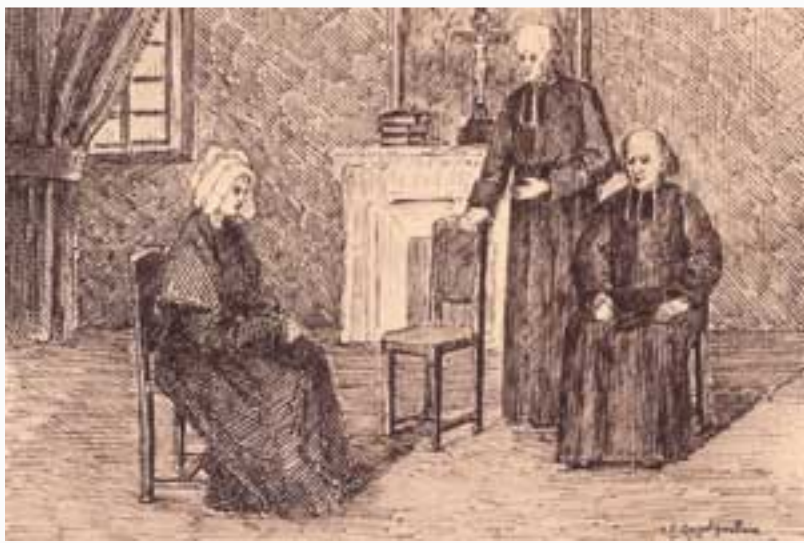
Jeanne-Antide receives her mission in Landeron (Switzerland)

At Landeron, busy educating children and taking care of a sick priest, Jeanne Antide had found again a calmer life. But she has to pack again and go where she did not choose. How to prepare herself for the uncertain and dangerous future that she could foresee? She does not have to search long. The Terror wakes up again. Having been in exile, Jeanne Antide must hide for almost a year at La Grange, a silent and prayerful prisoner in a tiny room offered by a friend at the risk of life.