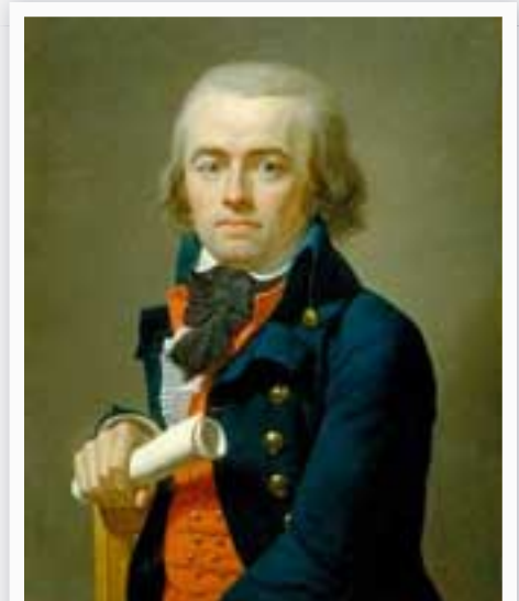
The Prefect Debry