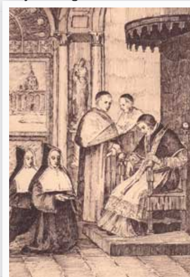
Meeting with the Pope who approves the Rule of Life of the Congregation