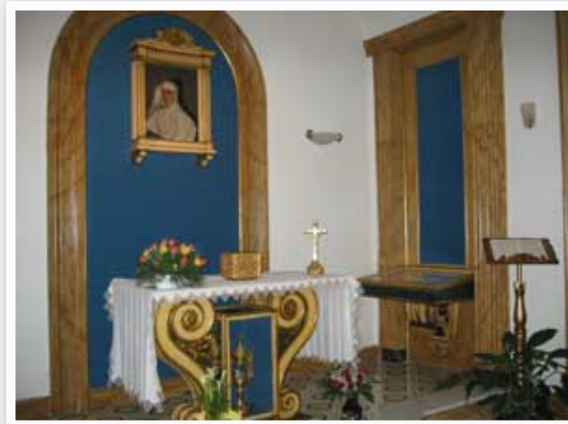
The room of Jeanne-Antide, in Naples, became a place of worship