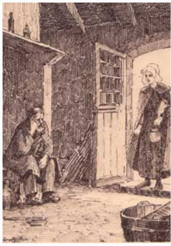
Jeanne-Antide in Sancey during the Revolution