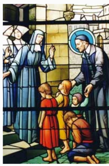
Saint Vincent de Paul and the Daughters of Charity (Blamont)