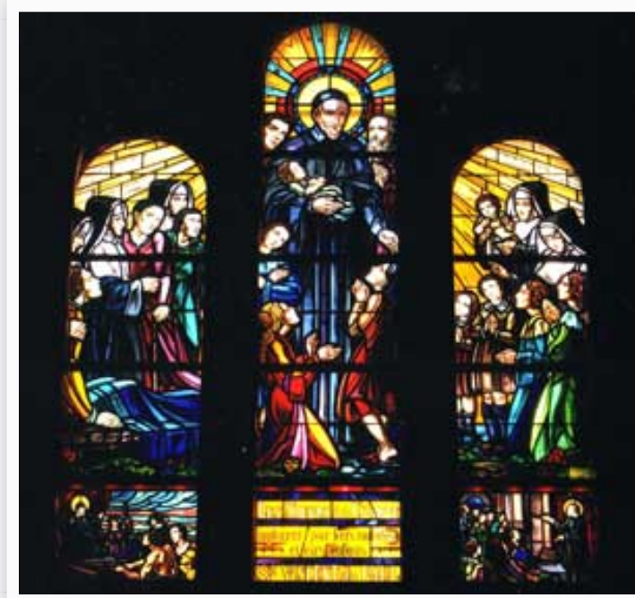
The sisters' service in the spirit of Saint Vincent de Paul