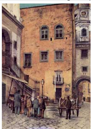
The square in front of the church of Regina Coeli