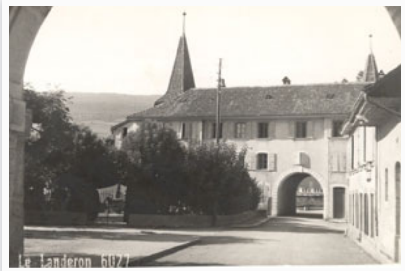
Landeron: house of the school