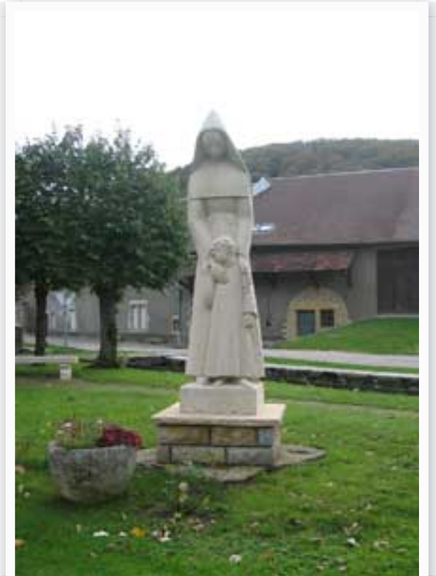
The statue erected in Sancey, on the occasion of the canonisation of Jeanne-Antide