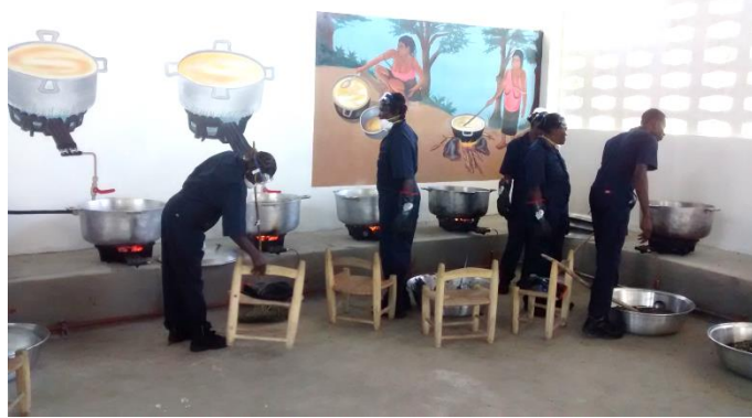
CLM graduates processing castor oil for the international market.

On February 23, 2015 in Lascahobas, VFHI partner, Kreyol Essence had a very special visit from former U.S. President William J. Clinton. Kreyol Essence is a social business focused on exporting eco-luxury beauty products from Haiti. In a strategic move, VFHI financed a project to provide training for women that graduated from an 18-month poverty alleviation program, Chemen Lavi Miyò, CLM (Pathway to a Better Life in English).