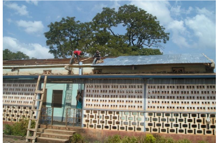
Renovations underway at the mission residence

Many basic needs confronted our confreres when they arrived at the parish. Most pressing were a means of transportation so they could make pastoral visits to the 18 communities, and urgent repairs to their dilapidated, and nearly uninhabitable residence.