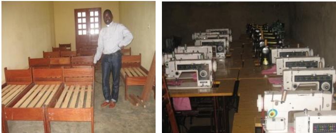
New beds and sewing machines for the center

Our confreres working in the Mission of the Central African Republic (C.A.R.)—under the Regional Mission of Cameroon—similarly confront challenging socioeconomic conditions in their work. Life expectancy at birth in C.A.R. is only 49 years; the mean years of schooling for adults is 3.5. Gender inequality is profound in C.A.R.: women and children often fall victim to forced labor and trafficking.