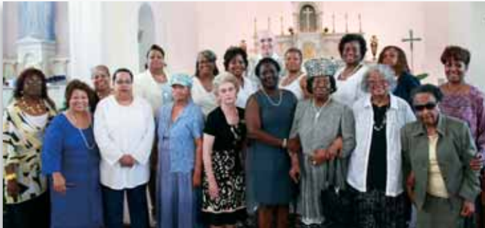
St. Cecilia's Ladies of Charity, Baltimore, Md

I am happy to share my travels, showing we are not alone in the service rendered to those less fortunate.