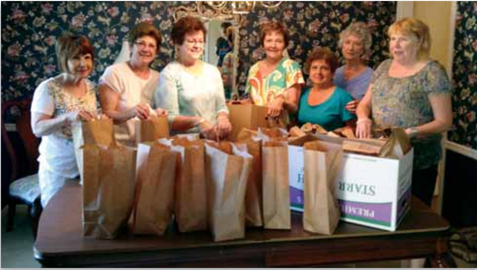
Left: Kansas City Ladies of Charity preparing lunches for Urban Rangers.