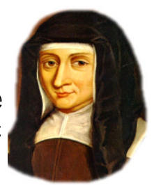
-St. Louise de Marillac

" You will love one another realizing that since God has chosen and assembled you to render Him the same service, you must be like one body animated by the same Spirit, and look upon one another as members of the same body."