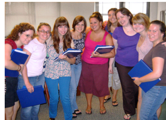
2008-2009 VSC Volunteers

When I applied to the VSC program, I said that I would go wherever I was most needed. I was placed in East St. Louis with the Education Advocacy Project. My responsibility as a child advocate is to work for the educational rights of children in the school district. The Education Advocacy Project is in its early stages so I am involved with many aspects of developing the program. I have an amazing work environment and I am surrounded by wonderful and generous people who dedicate themselves to serving the poor. I truly love the work that I am doing because I can really see that I can and will make a difference in the lives of the children that I am working with.