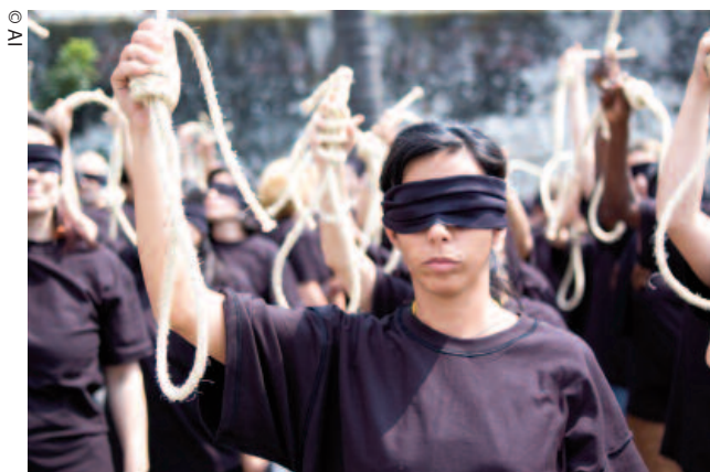
Seventy-one activists in Mexico protest to represent 71 children and young adults known to be in prison in Iran awaiting execution.