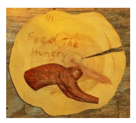
"For I was hungry and you gave me food." Mt. 25:35

Reflection: Jesus was hungry. How many people today hunger for food! How many people hunger for food for the soul! When I give food to feed a person's body, do I also give food to feed his/her soul?