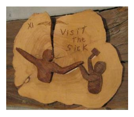
"...I was ill and you cared for me..." Mt. 25:36

Reflection: Jesus was confined to the cross. How many sick persons are confined by their illnesses! Do I bring the light of Christ to the sick?