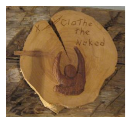
"I was...naked and you clothed me..." Mt. 25:36

Reflection: Jesus, as you gave all, help me to share what I have. How many people need the basics of life? Are my eyes open to recognize these needs?