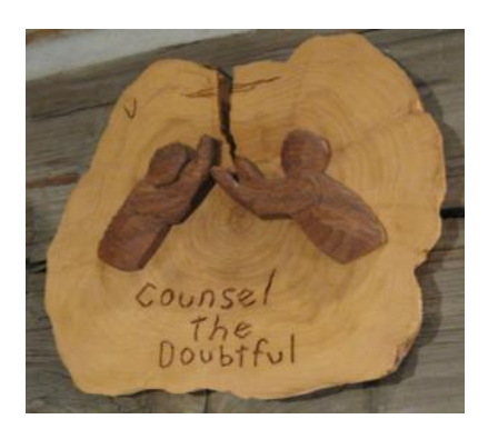
"Peace I leave with you, my peace I give to you...Do not your hearts be troubled or afraid." Jn. 14:27

Reflection: Jesus accepts help. How often others need help! How often we need help! Do I bring about peace with those whom I counsel?