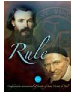
Rule Pocket Edition #1220 $1.75 English #1221 $1.75 Spanish

ORDER ONLINE AT WWW.SVDPUA.ORG (Click on SVdP Members, scroll down and click on Order Materials)