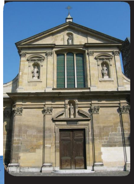
From top: St. Joseph des Carmes, St. Sulpice, Chartres Cathedral

Another very special day is in store, walking in the steps of St. Louise and Blessed Rosalie Rendu. Our morning begins with a visit to the Motherhouse of the Daughters of Charity at 140, rue du Bac, where the Blessed Mother appeared to St. Catherine Labouré. Catherine's tomb is here, as is that of St. Louise de Marillac. While here, we will attend the 10:30 a.m. Mass at the Miraculous Medal Chapel. After lunch on your own, we will visit Montparnasse Cemetery to visit the graves of Rosalie Rendu and the Ozanam