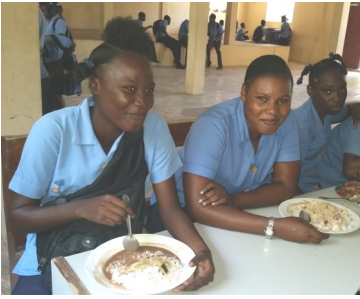
Saint Anne school students, Thomazeau

Launched in October 2013, our education program tackles hunger and education improvement. In collaboration with Mary's Meals, an international anti-hunger movement, we feed 14 schools in the Central Plateau. Separately, we feed 3 Vincentian schools in Port-au-Prince. Daily we feed