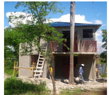
Administrative offices, LaHoye

latrine, water purifier, and business training. Chemen Lavi Miyò (CLM) or "Pathway to a better life" costs $1,500 per family our goal is to fund 150 families with $225,000.