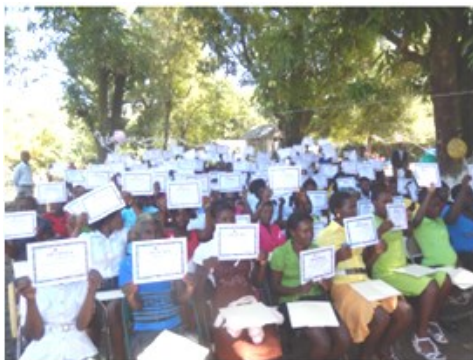
CLM graduates proudly show diplomas

The VFHI is proud to announce the graduation of our first Chemen Lavi Miyò (CLM) or Pathway to a Better Life cohort in February 2014. 290 out of the original 300 members graduated. This 18