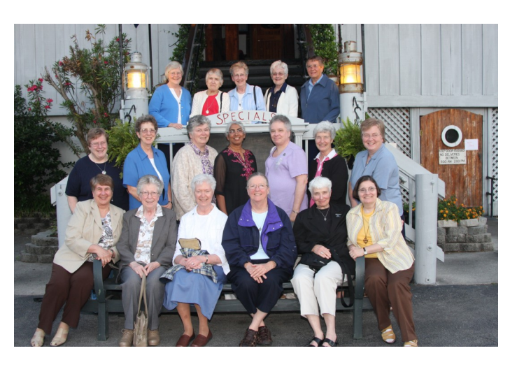
Liaisons gather in South Carolina

Following the leadership meeting, the liaisons from each of the member congregations of the Federation gathered to review the work of the NGO office from the past year and chart new ini-